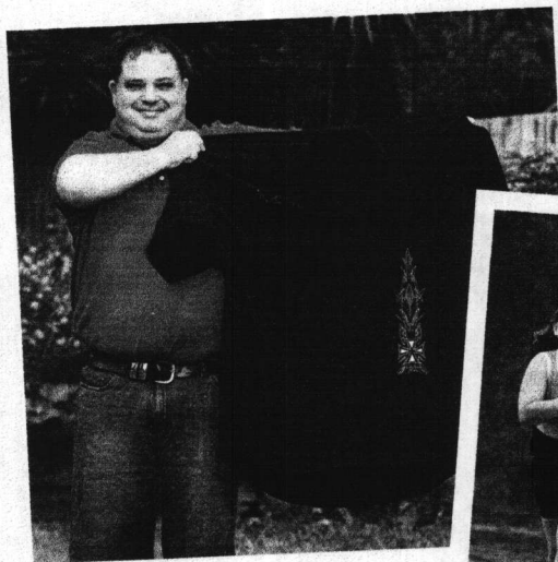
The reality TV star shows off a shirt that no longer fits.

• My Kitchen Rules screens Mondays to Wednesdays, 7.30pm, on Channel Seven.